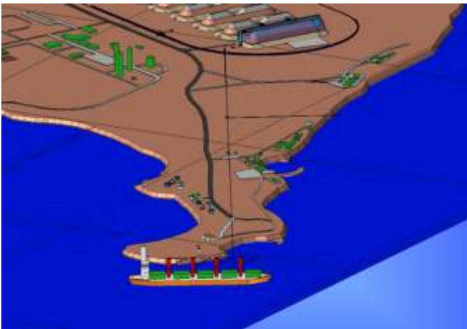
Port Bonython Port Layout